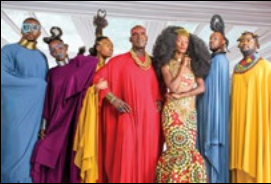
The Court by Marvin Bowser

Created in 2023, "BlackHair" is Marvin Bowser's love letter to Black people and culture. From over 3,000 images, Bowser has curated 41 for this exhibition, which you will see around Woolly's lobby. The collection speaks to Black joy, love, beauty, strength, resilience, expression, and fantasy. Find out more about the collection on Bowser's website .