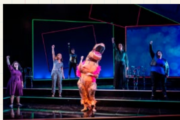
She the People: The Resistance Continues! / 2019

When we moved to this space in 2005, we suddenly had more time to fill because we had our own venue. We weren't prepared to produce a lot more plays than we had before, at least not right away. So, what were we going to do with the extra time?