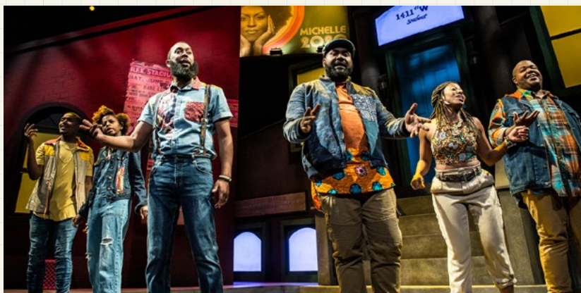
The Second City's Black Side of the Moon , 2016.