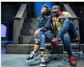
Black Side of the Moon / 2016

In one week they re-wrote more than a third of the show. They came up with new material out of the seat of their pants. Normally, The Second City develops stuff by improv in front of an audience, but this time, they just wrote new sketches to meet the moment. We scheduled more dress rehearsals than usual and more