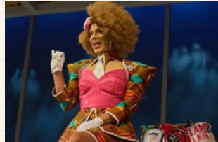
Ain't No Mo' / 2022 / Photo by DJ Corey

Yes, I think of playwrights like Robert O'Hara. His play Bootycandy , for example, was a series of short comic sketches that related in many ways to a Second City event. It was written from a specifically Black, gay perspective, mostly meant to make you laugh, but usually subverting stereotypes, turning around liberal expectations in shocking ways – all the stuff that Robert does so brilliantly. Jordan Cooper's Ain't No Mo' is a more recent example – a collection of surprising sketches around a set of interrelated themes.